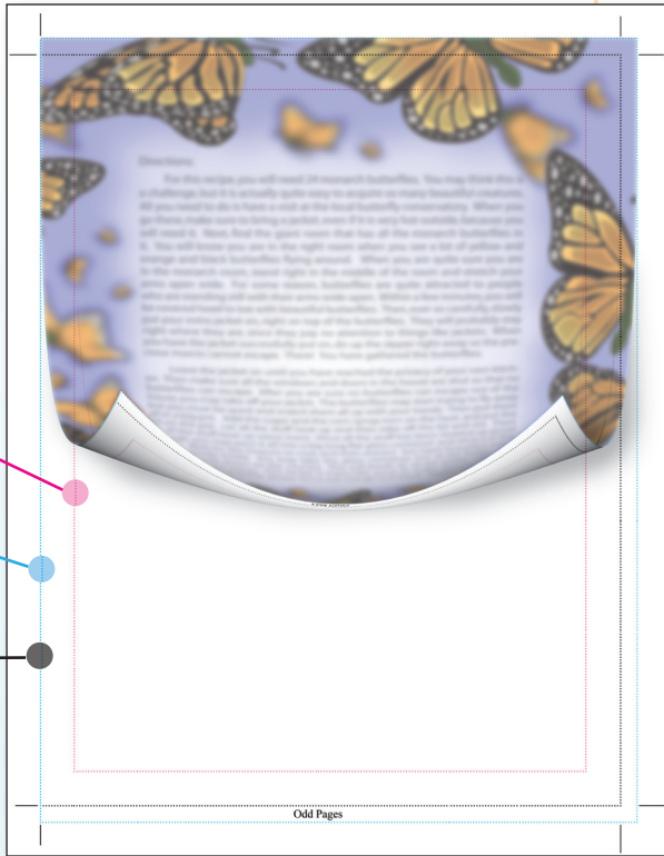
The image above is for an Odd Page (Right side page). Even Page numbers will be a Mirror Image of the one above. (spine fold will be on the right, bleed will be on the left)