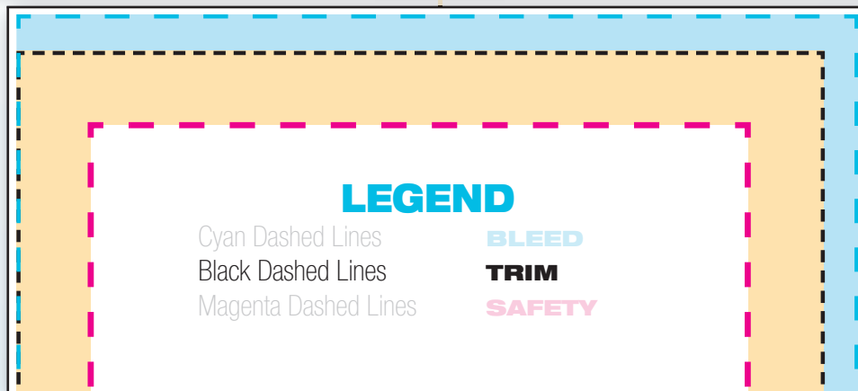
Enlarged view of the top of an interior Odd numbered page. Even numbered pages will be a reversed image (with spine/fold on the right)

Black Dotted Lines show the “trim” dimensions.